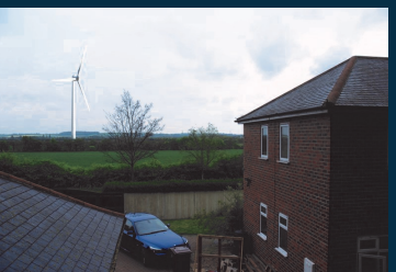
View from Mid Nottingham, Road