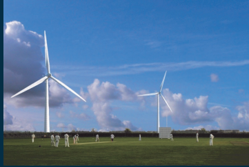
View from Poplars Sports Ground

Larger views online at www.burtonjoyceparishcouncil.org.uk