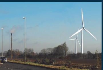
View from A612 junction

Burton Joyce Parish Council Parish Council Office 135 Church Road, Burton Joyce, Nottingham, NG14 5DJ Tel: 01159 314084