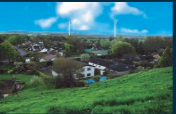
View from Maris Drive