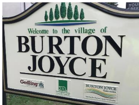
New village signs part-funded by NCC and GBC installed in the summer

The Neighbourhood Plan is almost complete, after enormous efforts by Terry Hazard and his team, and we think we can see the beginning of the end!