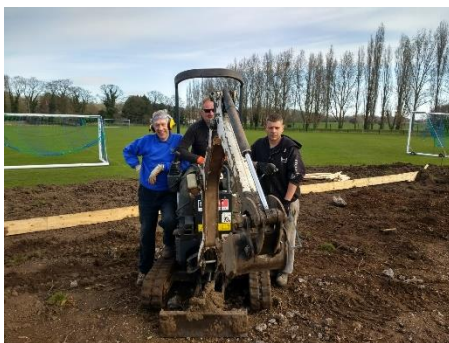
Digging the foundations for the Bowls Pavilion

After a bit of a delay we are now on with the foundations for the new Bowls Club Pavilion, which is due to be finished by the end of May. It will be a great asset to the Bowls Club and the Poplars.