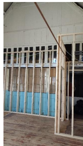
Building works at the Old School Building