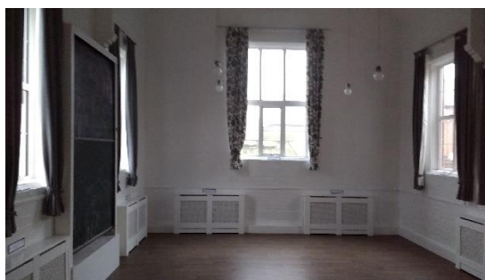
Main Hall in the Old School Building

Our finances have been subject to some unusual items of expenditure this past year, largely due to the refurbished the Old School Building which now houses the Parish Office. It also accommodates the Windmill Kindergarten, The Burton Joyce Players, Children’s Sensory Therapy and the newly named Burton Joyce Brass Training Band. The Main Hall is available to rent most evenings to other community groups and societies.