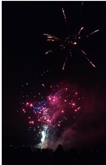
Big Bang Fireworks Display

The continued increase in use of the Poplars shows that it is a facility that the residents of Burton Joyce should be proud of.