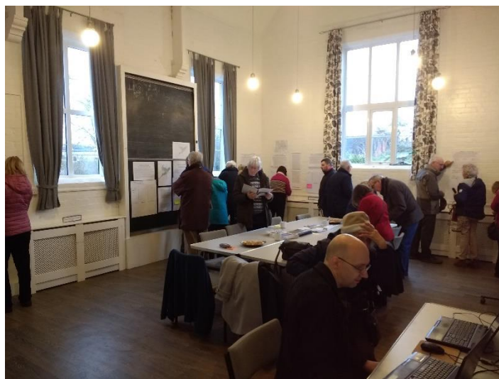
Neighbourhood Plan Consultation Event in the Main Hall of the Old School Building

*Obtained from the Household Survey from resident's feedback in preparation for the Neighbourhood Plan.